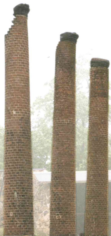
Original Cherokee Female Seminary columns from 1851.

Visit the Cherokee Heritage Center and discover the legacy that defined a nation.